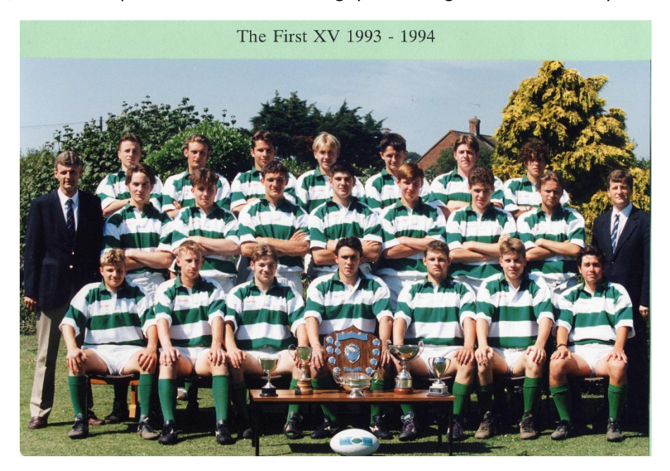
Purchase price £10 per copy plus postage

All proceeds from the sale of this book will be donated equally to: